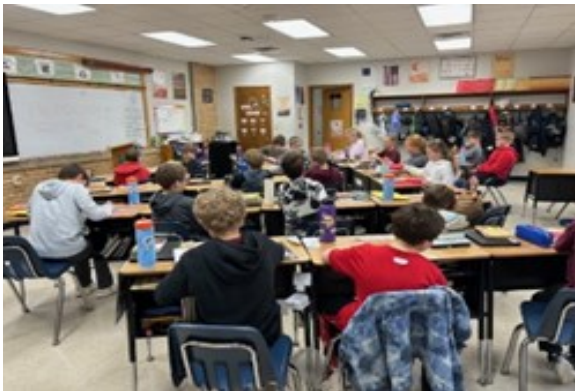
Classroom space on the west side of school, by the stairway, are 639 square feet. Pictured here are 21 5 th grade students.

There is a great need for our middle school students to have an area designed to meet their specific learning styles and growing personalities. This area would have better system set up for student flow and collaboration without interfering in the elementary environment.