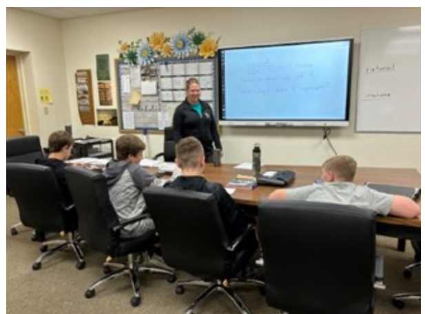
Our enrichment classes are taught in the faculty room. It has a continual flow of papers from the copy machine and foot traffic of teacher gathering material during their preparation periods.