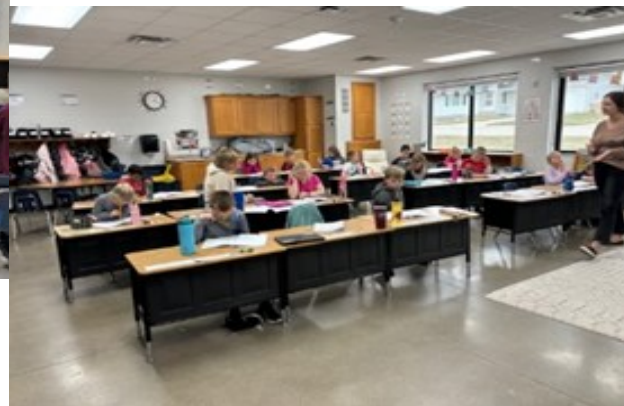
By comparison, the newest classrooms are 847 square feet. Picture here are our 21 2 nd grade students.