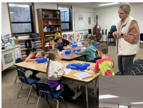
Here you can see the downstairs room is both a classroom and an orchestra room.